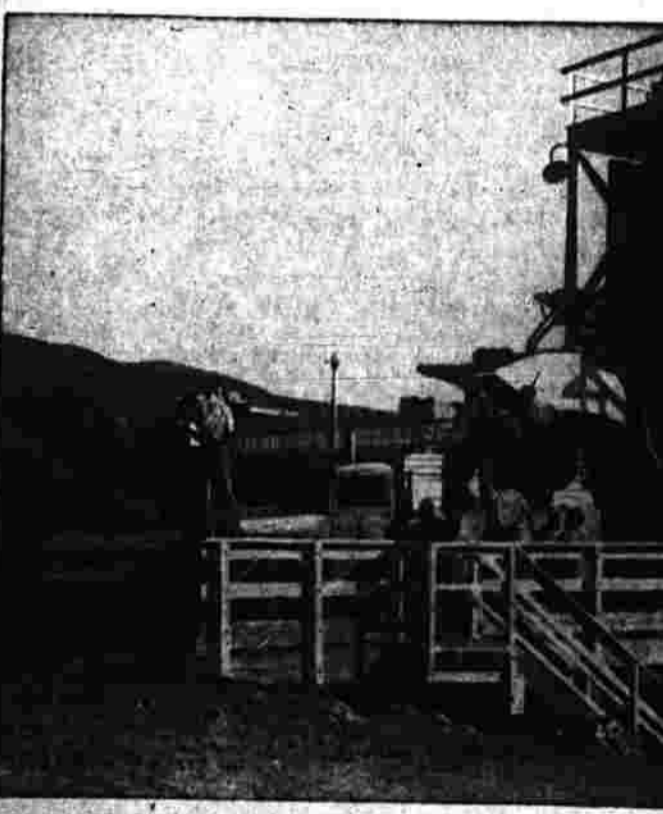
GRAND COULEE FISH FERRY —Because of importance of salmon to the Pacific Northwest, the ferrying by means of trucks in the Grand Coulee dam, Washington, is a big step at South Island dam, which will transport the salmon from Grand Coulee to streams below the dam. The fish ride in a 1,000-ton tank above the tank on track. Tank holds still water "underneath" fish for transport below. Trucks are on tracks above tank.