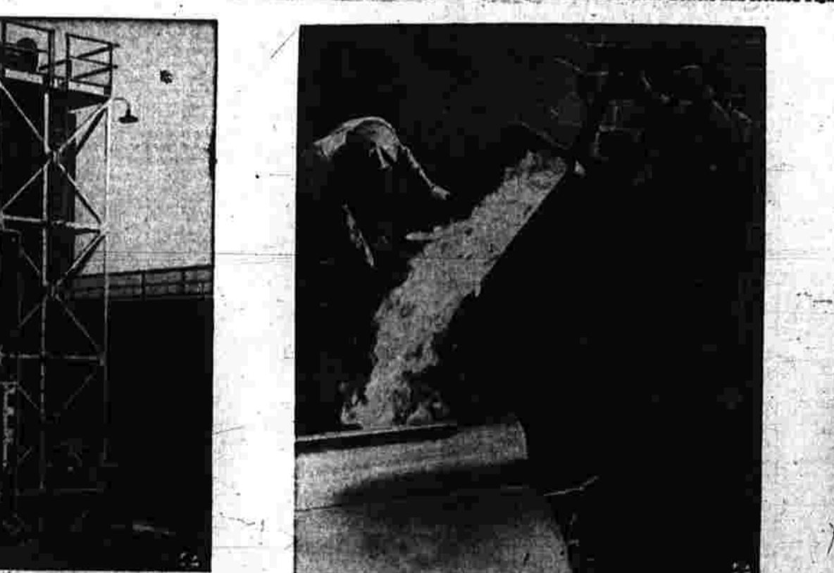
WHEELED AQUARIUM —When salmon are ferried by Grand Coulee dam, they are carried in a 1,000-ton tank above the tank on track. Tank holds still water "underneath" fish for transport below. Trucks are on tracks above tank.