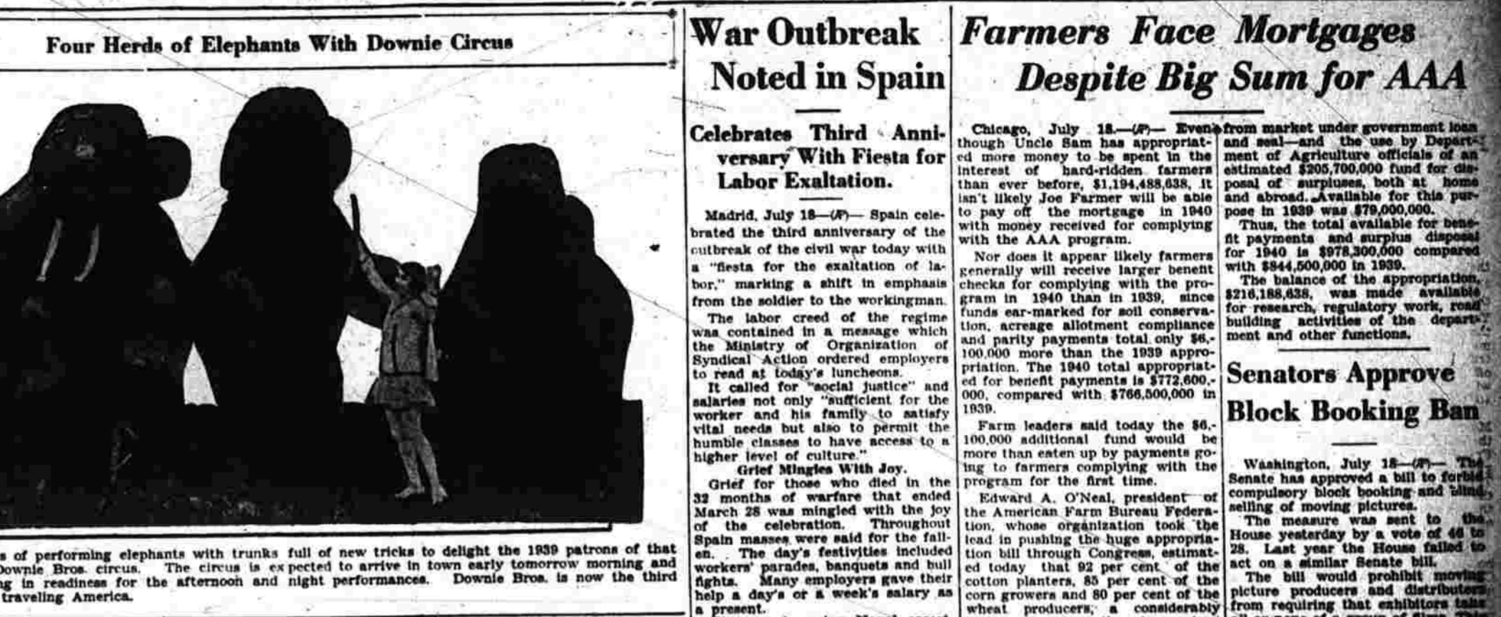
Four herds of performing elephants with trunks full of new tricks to delight the 1839 patrons of that largest circus...