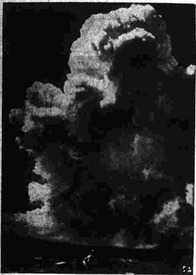
SMOKING OUT THE ENEMY —Man showed Mother Nature a trick or two, making clouds at Edgewood Arsenal, Md., during a demonstration of chemical warfare. Different types of smoke help lay down cover to cloak maneuvers.