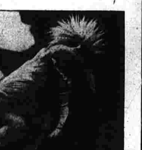
U.S. DELEGATE —American Girl Scouts have Senator Newt Carter (above) as representative of the organization in New Brunswick July 16-17.