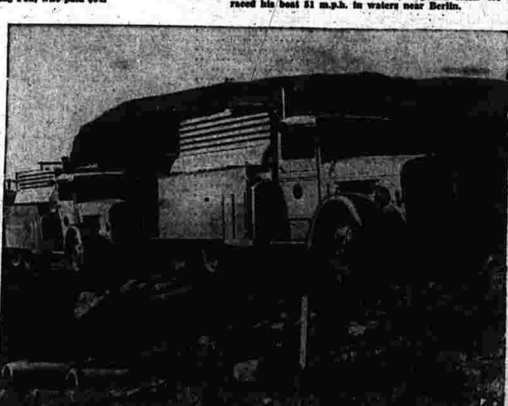
ALL ABOARD THE FISH FERRY —Right of these trucks, aluminum needed to build tank for carrying salmon from Grand Coulee dam, on the Columbia river above Grand Coulee to streams below the dam. The fish ride in a 1,000-ton tank above the tank on track. Tank holds still water "underneath" fish for transport below. Trucks are on tracks above tank.