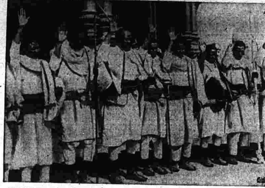
WHEN IN ROME, DO AS ROMANS —That old rule of safe conduct seems to apply well to these Italian athletes who visited Rome, Italy, recently and gave above Fascist salute in welcome by Italian who greeted them in Rome, Italy, July 9, 1939, when King Emanuel was proclaimed emperor of Ethiopia. By virtue of this conquest, Italy acquired another 350,000 square miles of mountainous volcanic African territory.