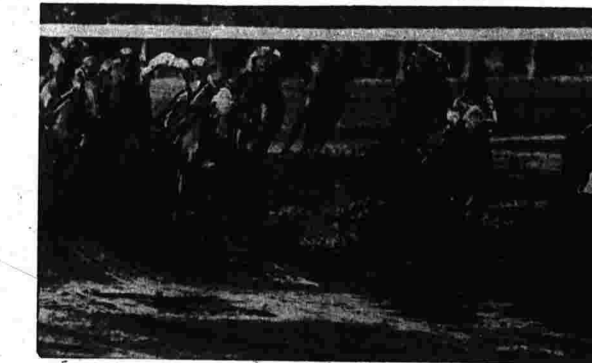
FIGHTING FOX LIVES UP TONAME —Through sabbath-day and Fighting Fox (right) shows by last turn at Suffolk Downs to win 150-odd added Massachusetts handicap, beating Pompano and Chalfont. Before had scored Fighting Fox, who paid $21.